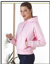
Ladies Hooded Sweatshirt (RK127)