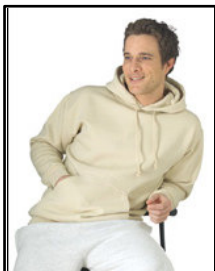
Men's Hooded Sweatshirt (RK24)